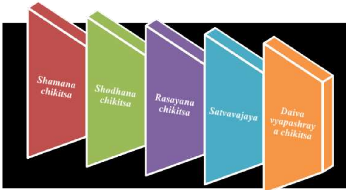
Figure 1: Ayurveda therapeutic approaches for disease management